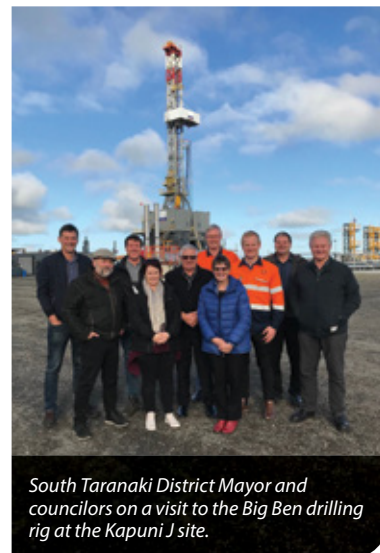
South Taranaki District Mayor and councilors on a visit to the Big Ben drilling rig at the Kapuni J site.

We recently produced a factsheet sharing our journey toward a low emissions future. You can find a copy of this factsheet on the Todd Energy website. We look forward to sharing more updates in the future, as we continue our low emissions journey.