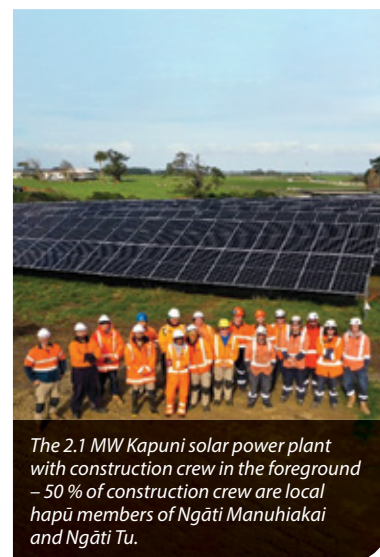
The 2.1 MW Kapuni solar power plant with construction crew in the foreground – 50 % of construction crew are local hapū members of Ngāti Manuhiakai and Ngāti Tu.