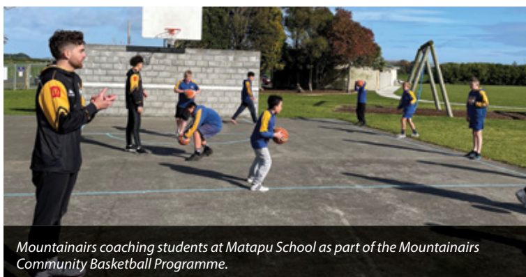
Mountainairs coaching students at Matapu School as part of the Mountainairs Community Basketball Programme.