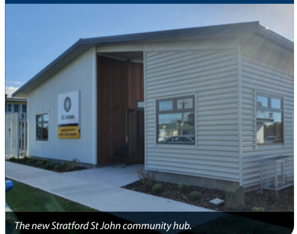
The new Stratford St John community hub.